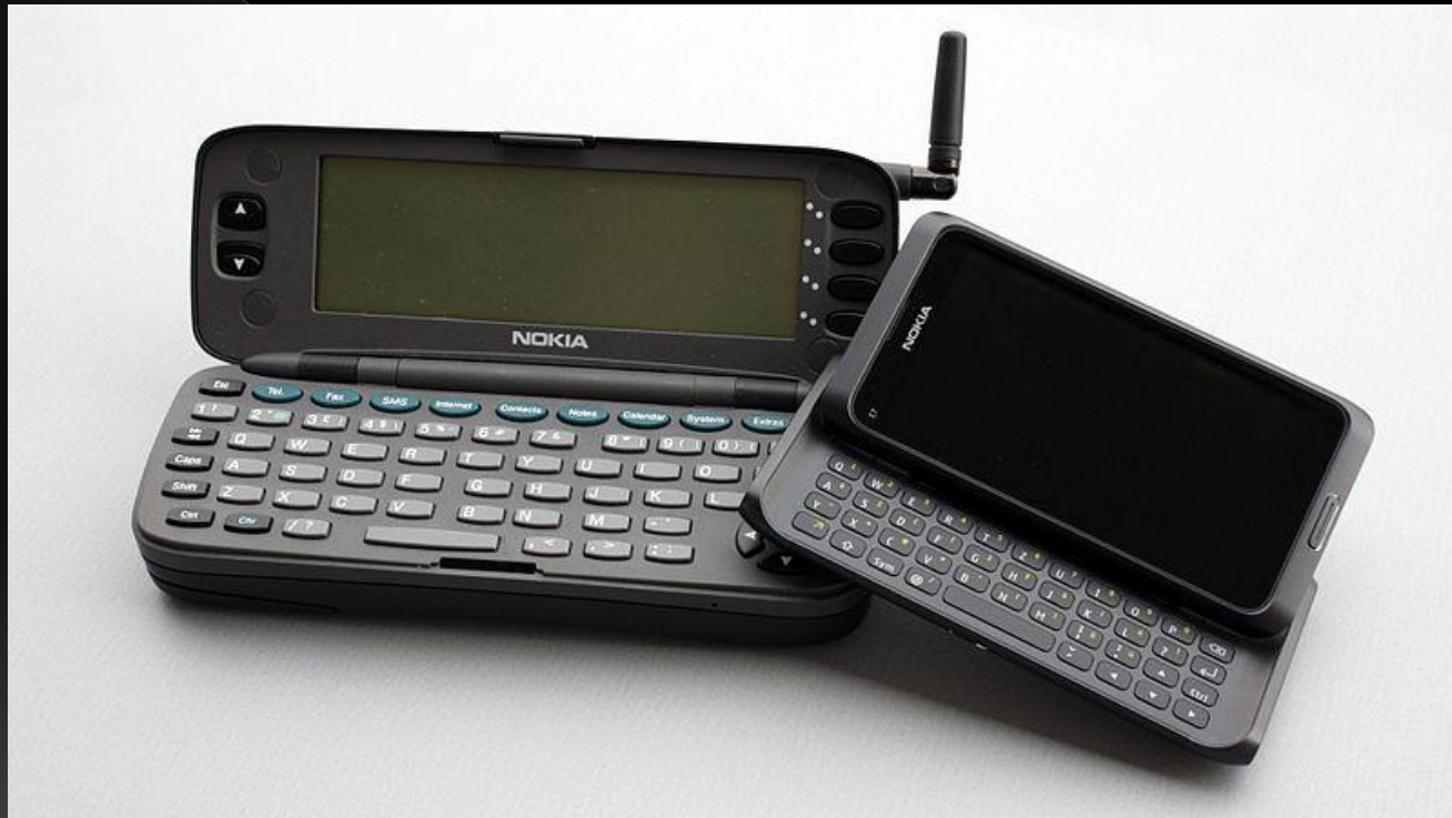
Nokia 9000 Communicator (1996) beside the Nokia E7 (2010).